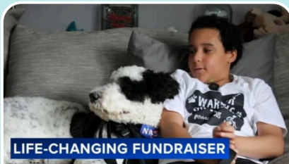
6ABC.COM Community rallies behind 12-year-old boy with cerebral palsy to get service dog -med